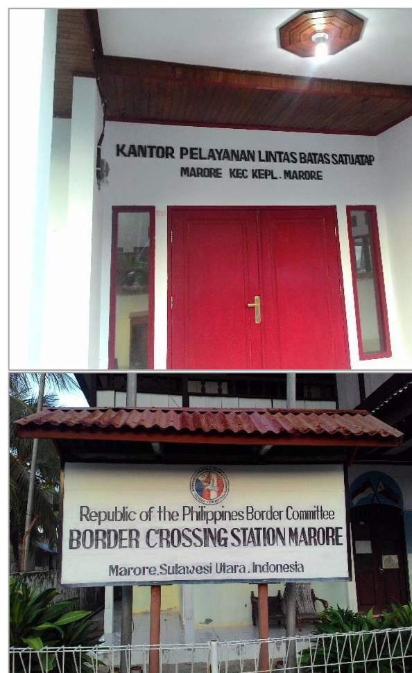
Figure 2. Border Crossing Station in Marore Island

value of traded goods should not exceed 1,000 pesos or the equivalent of US $150 per person on a single journey or in a boat, not exceeding 10,000 pesos or the equivalent of US$1,500. Items traded from Indonesia include agricultural products and various local products in the border region, excluding mining and oil. Meanwhile, items traded from Philippines include daily consumer goods and various equipment needed in the Indonesian border region.